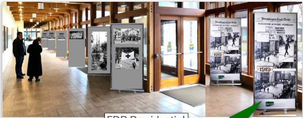
FDR Presidential Library & Museum