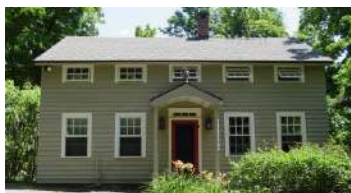
Jackson House 2019