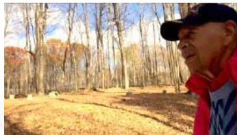
May 13, 1917~ Pine Plains Register