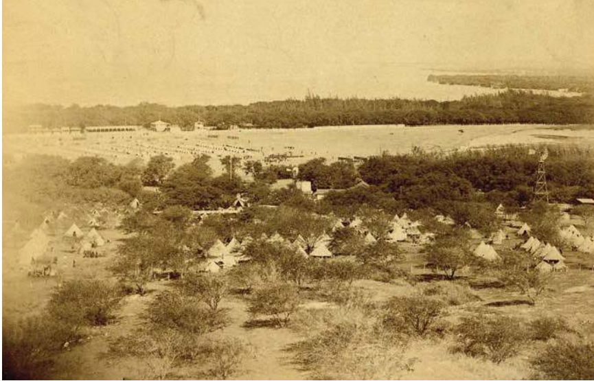
Figure 9. View of the Army Camp looking out to sea over the Pacific Ocean, Hawaii. Company K, Spanish-American War, 1898.