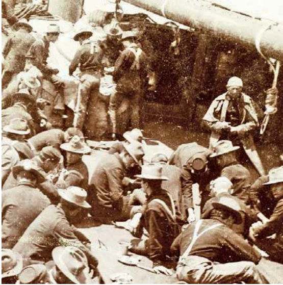
Figure 7. Soldiers on deck traveling from California to Hawaii. The Spanish-American War, 1898.

of the voyage across the ocean to the Hawaiian Islands (Figures 6 and 7), ones that capture the discomfort of the men as they battled the cold ocean breeze and as they came onto the deck for air from the cramped and stuffy conditions below decks.