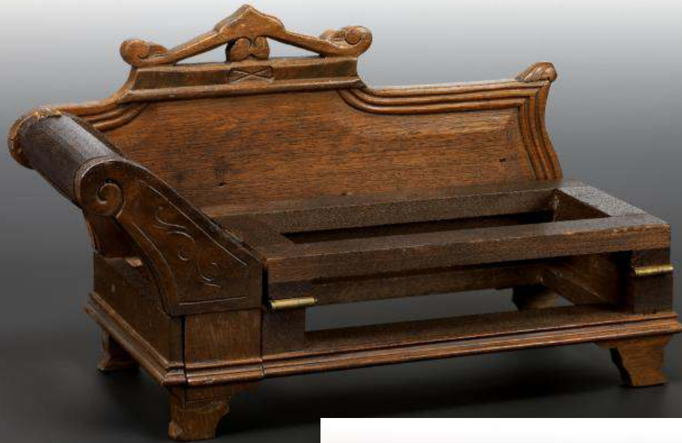
Sofa Bedstead patent model. 1877, mixed media, Smithsonian American Art Museum.